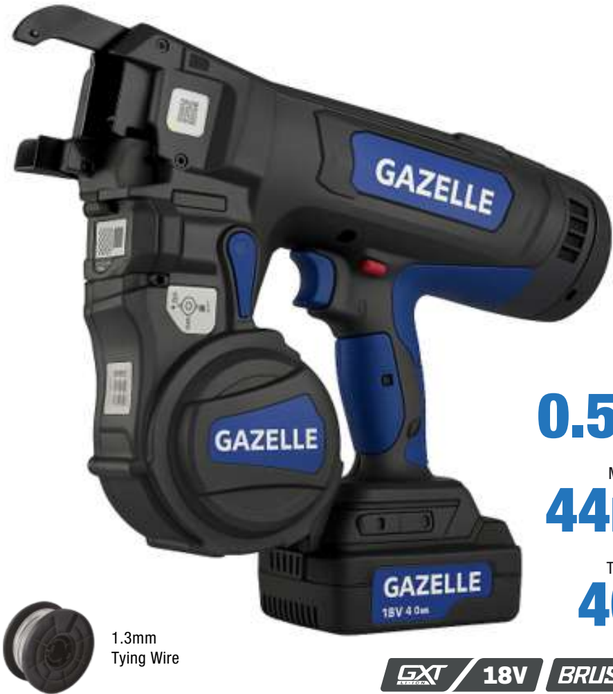
1.3mm Tying Wire

REDUCE WIRE WASTAGE Single wire system with pull back mechanism to save costs and provide wire tightness