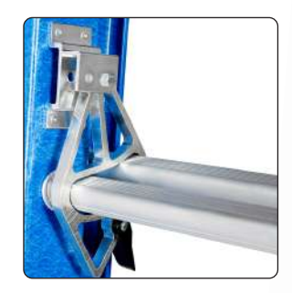
Heavy Duty extruded rung locks are spring loaded to operate smoothly