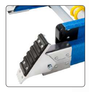
Robust, self-aligning, free-swinging shoe with slip-resistant rubber pads