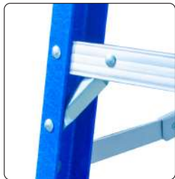
Wide slip resistant steps for increased stability