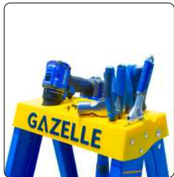
Multi-functional top to keep tools organized & safe