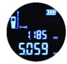
LCD HD Screen