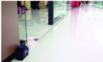
One button laser measurement

This tool can be used in interior/exterior design, construction, traffic accident evidence gathering, factory supervision, engineering inspection, real estate development and assessment, fire assessment, public facilities planning, gardening, and electronics industries