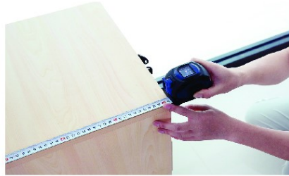
Hand drawing rule measurement