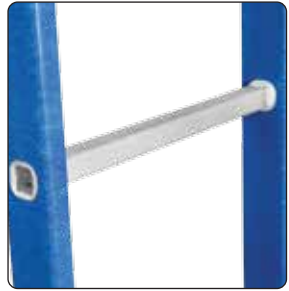
Square rungs for better footing and comfort