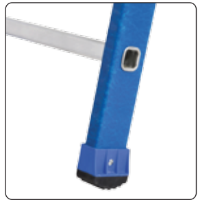
Slip resistant foot for maximum grip on any surface